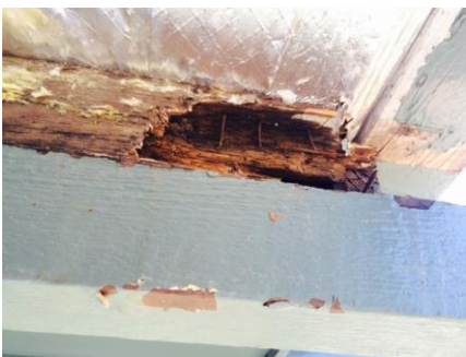
Floor joists that needed reinforcing